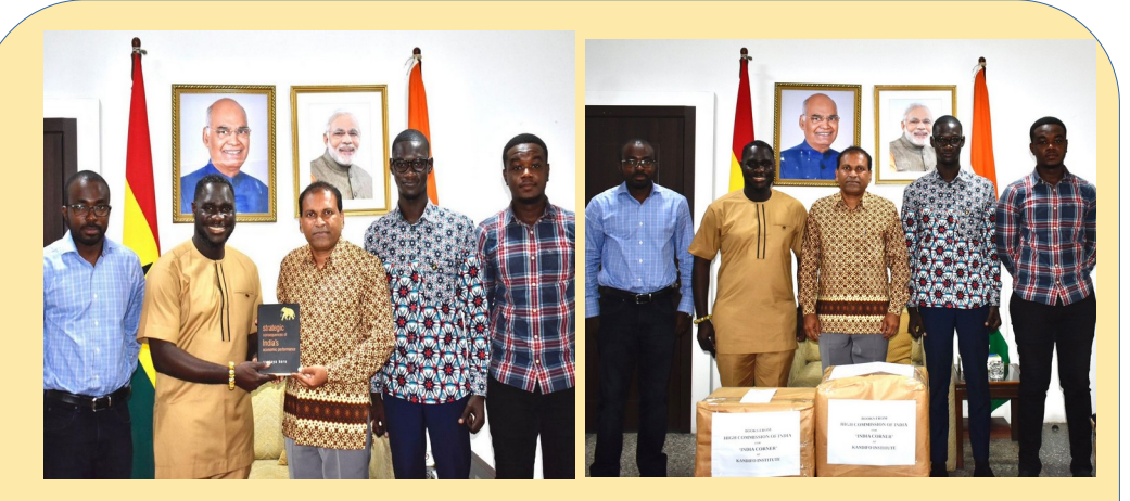
High Commissioner gifted books on various facets of India to Kandifo Institute, a young think tank in Accra