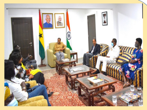
Board Members of Ghana India Trade Advisory Chamber (GITAC) called on High Commissioner to express their gratitude for his steadfast support to the Chamber