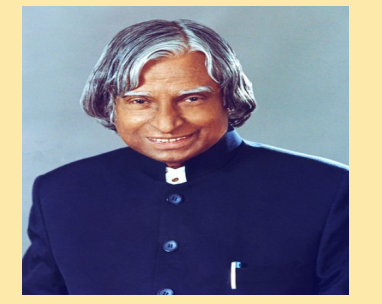
Never stop fighting until you arrive at your destined place — that is, the unique you. Have an aim in life, continuously acquire knowledge, work hard, and have the perseverance to realize the great life"